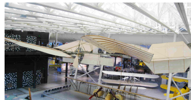
The Aerodrome at the Udvar-Hazy Annex

Today both The Flyer and the Aerodrome on displayed by the Smithsonian. The Flyer is on display at the National Air and Space Museum on the Washington Mall. The Aerodrome, restored to its original configuration, may be seen at the NASM Udvar-Hazy Annex