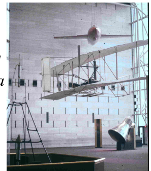
The Flyer framed by the Bell X-1, a Goddard Rocket, and a Space Capsule in the Milestone of Flight Gallery