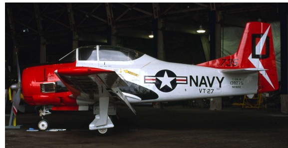
Privately Owned Trojan in Navy Livery

06 April, 1953-First Flight of the North American T-28B Trojan.