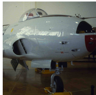
P-80 displays its six Browning .50 calibre machine guns.

In 1950, Lt Russell Brown, USAF, flying a Lockheed P-80 Shooting Star, downed a North Korean MiG-15 in the first all jet combat shoot-down.