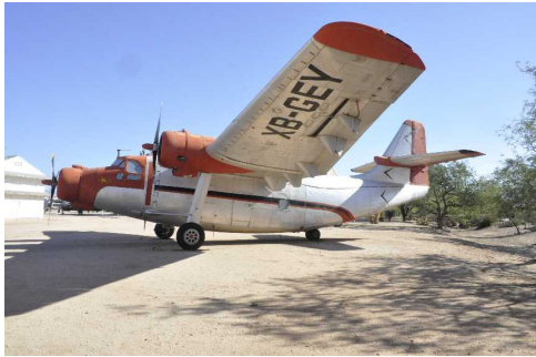
YC-125A at Pima bearing Mexican registry assigned to Triplay y Maderas de Durango S.A.

However, their intended roles were superseded by helicopters and the Fairchild C-123 Provider which were one step ahead of the Raider in STOL and cargo carrying performances.