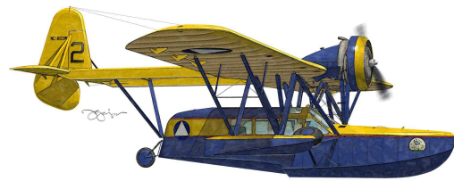
CAP TIMELINE FLIGHT Sikorsky S-39B NC803W ©1942 Coastal Patrol Base No.2, Rehoboth Beach, Delaware