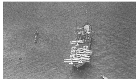
The Dédalo with a half dozen Supermarine Scarabs aft and a blimp forward.

September 3, 1925 – The Spanish Navy's aviation ship Dédalo is sent to support the Spanish and French landings at Alhucemas, Spanish Morocco. The combined forces amphibious assault is part of the Spanish and French efforts to end the Rif War, an anti-colonial insurgency led by Abd el-Krim.