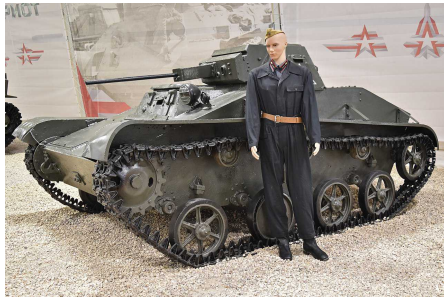
T-60 at the Kubinka Tank Museum.

September 2, 1942 – The Soviets test fly the Antonov A-40T “winged tank.” A weakness of airborne troops was a lack of armor support and a number of remedies have been tried, parachute, glider and assault transport delivery and even the very low level release of a tanks directly onto a suitable surface but Antonov tried attaching airfoils and control surfaces to a T-60 light tank, towing it to the battlefield and releasing it to glide down with its crew inside, ready to join the fight immediately upon landing.