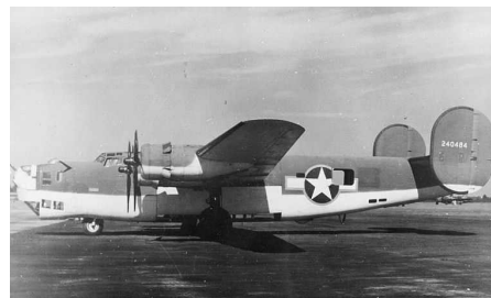
Navy B-24D. The retractable search radar dome is barely visible aft of the bomb bay

Planning had assigned off-shore operations to the U.S. Navy but they did not have the equipment allowing long range patrols so the Army Air Force and the Civil Air Patrol flew the missions.