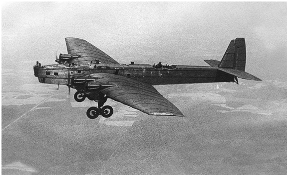
The four 700 hp engines of the TB-3 were inadequate.

In the sole actual trial, the tank was stripped of armament and ammunition and lightly fueled. The drag was still too much for the TB-3 plane and it cut the A-40T. But the gliding tank managed a safe landing and returned under its own power to the airport. However, the lack of adequate tow planes led the authorities to cancel the project.