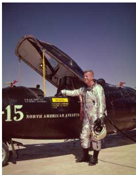
Joe Walker and X-15 #3.

The first is the North American X-15 which exceed the 62 mile altitude twice in 1963, both piloted by NASA's Joe Walker. Three were built and both space flights were flown in X-15 #3.