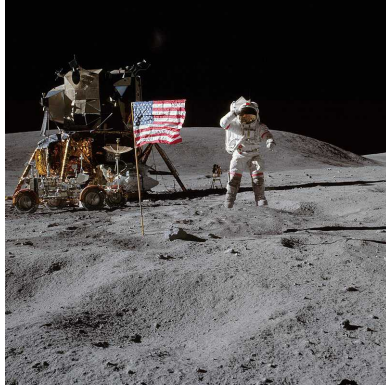
John Young jumps 42 cm high and salutes the National Ensign. The Lunar Module Orion is to the left.

April 21, 1972 – Apollo 16 lands in the Descartes Highlands on the moon. John Young and Charlie Duke spend 71 hours on the lunar surface while Ken Mattingly manned the orbiting command module.