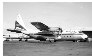
Delta L0100-200 Cargo Plane

Delta Airlines owned three and operated five others on short term lease and operated them between 1966 and 1974.