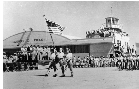
A WASP class passes in review

April 24, 1943 – The first class of the Women Air Force Service Pilots (WASPS), Class 43-1, graduated from the four-month flight training program and earned their wings as U.S. Army pilots.