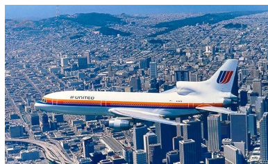
This United TriStar still bears an “N” number with a “PA” suffix.

April 22, 1985 – Pan Am sells its Pacific division to United Air Lines for $750 million. The deal includes all Pan Am's East Asia and South Pacific routes as well as 11 Boeing 747SP's, 6 Lockheed “TriStars” and one McDonnell Douglas DC-10.