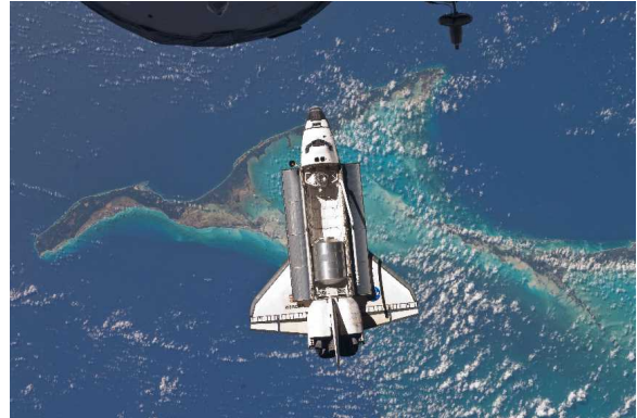
The last mission, STS-135. Atlantis is photographed from the International Space Station. The cylinder in the aft portion of the cargo bay is the Multi-Purpose Logistics Module.

Between 1981 and 2011, The Space Shuttle Orbiter fleet accomplished the feat 134 times.