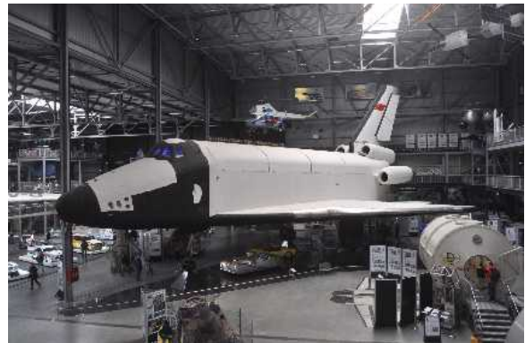
Buran, OK-GLI, an atmospheric test vehicle fulfilling missions similar to the Enterprise.

There have also been two unmanned space planes. The Soviet Buran made its one flight in 1988 controlled from launch to landing by computers.