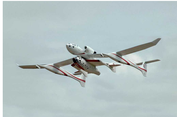
White Knight and SpaceShipOne. Note the similarities of the forward portion of each aircraft. White Knight also served as a flight trainer for the SpaceShipOne crew.

Without doubt, Burt Rutan sits in the pantheon of aircraft designers along with notables such as Jack Northrop, Ed Heinemann, Fred Weick and Lloyd Stearman. His Scaled Composite Models 316 SpaceShipOne and 318 White Knight One paired together to become winners of the $10 million dollar Ansari X Prize for achieving sub-orbital flight by a privately funded space craft. Both sport twin booms.