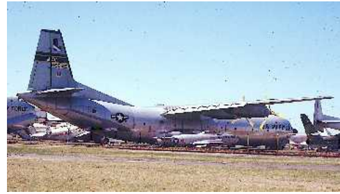
The C-133B at Bradley before the tornado.

April 23, 1956 – First flight of the Douglas C-133 Cargomaster. The Cargomaster was a turboprop strategic airlifter which filled in the gap between the piston engine Douglas C-124 Globemaster II and the Lockheed C-5 Galaxy in 1970.