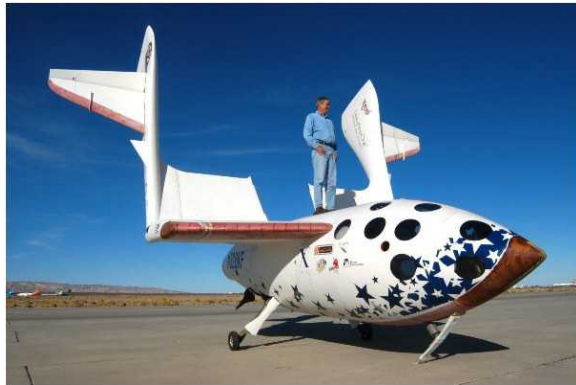
Burt Rutan poses with SpaceShipOne's tail in the high drag configuration needed to slow its re-entry into the atmosphere.

boom tail surfaces are lifted and used as air brakes. Walton and a pilot who owns several warbirds.